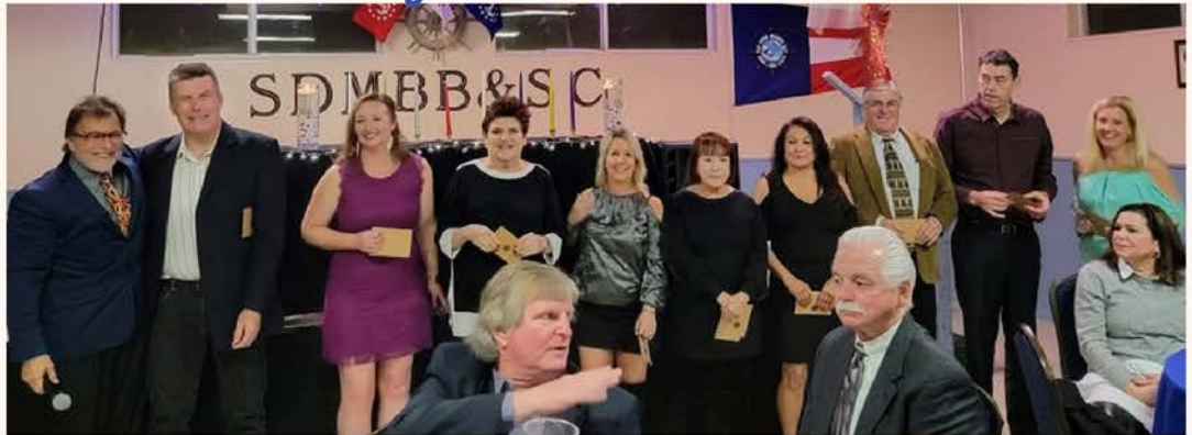
Volunteers were rewarded with gift cards as a thank you to their contributions to the Boat Club.