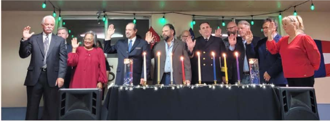
San Diego Mission Bay Boat and Ski Club Officers and Board of Directors 2023