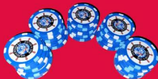
25 BOAT CLUB DRINKS