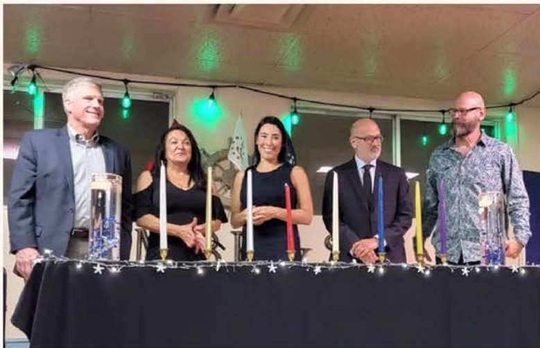
Board Of Directors for 2023