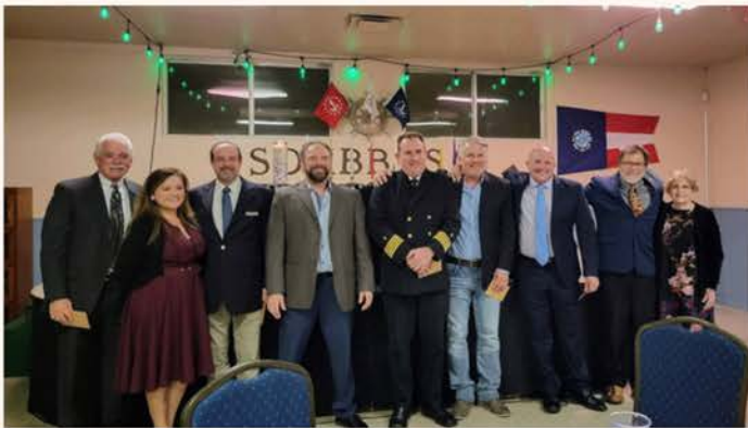
Outgoing Officers for 2022