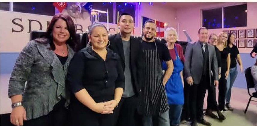
Good food, good fun, good service. The staff that planned, cooked and served the Installation Dinner, kept the drinks flowing made it a successful evening.

Gratitude and thanks to those that attended, and to those that made it happen.