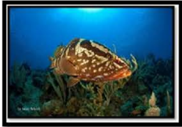
Enjoy the beautiful wildlife