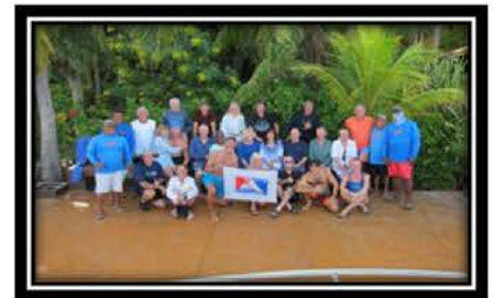
Enjoy a Beautiful Resort